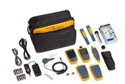
FKT1475 Complete Fiber Verification Kit